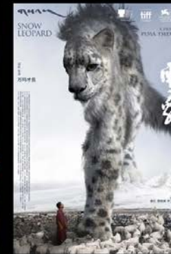
SNOW LEOPARD* Sept '24