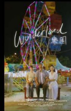
WONDERLAND Aug '24