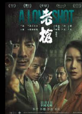
A LONG SHOT* Jan '25

+ Exclusive Post Screening Q&As with Filmmakers