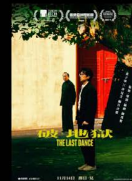
THE LAST DANCE Nov '24